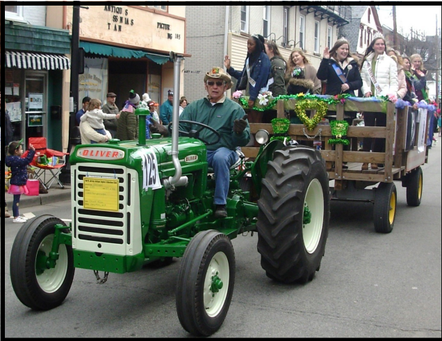
For the 2nd year in a row, the Township Misses hitched a ride on our hay wagon!